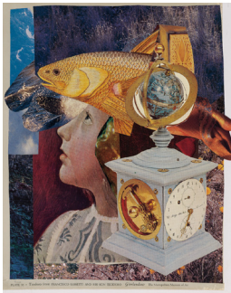
Wendy Woodson Collages