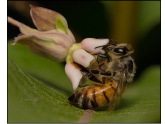
Renee Hill Macro Photography