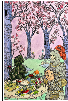
Pamela Acosta Illustration/Paper Arts