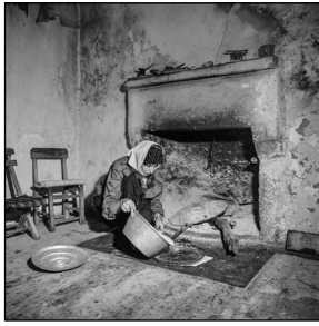
Stan Sherer Retrospective (photography)