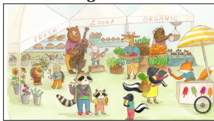
Chaldea Emerson Watercolor Illustration