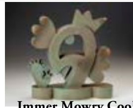
Immer Mowry Cook